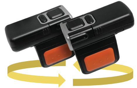
AMBIDEXTROUS RING TRIGGER

For the further inquiry, please contact: service@pointmobile.co.kr