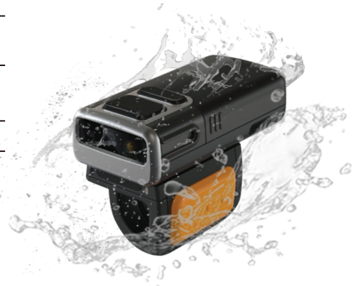
IP65 WATER/DUST RESISTANCE